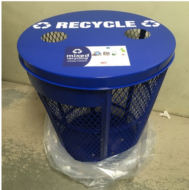
Portsmouth High School athletic field recycling barrel