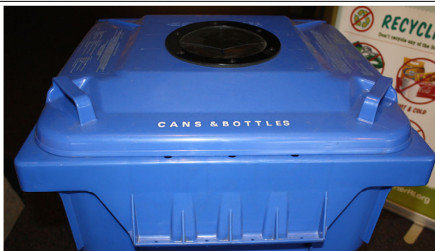
And/or, place label above cart

Cover existing “cans and bottles” or “paper only” designations. If possible, label the top and sides, or whichever side faces bin users.