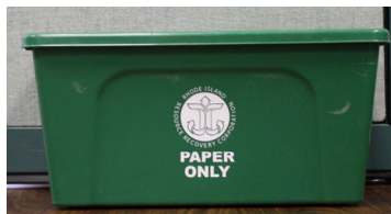
6-gallon deskbin bin:

Place the label over “paper only” and RIRRC logo.